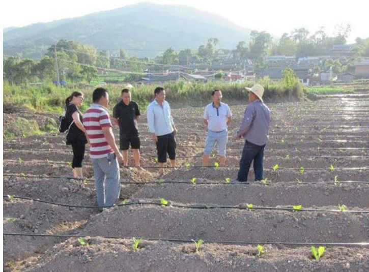
Figure 3 Schematic illustration of drip irrigation technology in a region of Yunnan province

In practice, technical personnel can choose drip irrigation technology (as shown in figure 3), channel irrigation technology, sprinkler irrigation technology and water conveyance irrigation technology in low-pressure pipeline respectively. Taking the application of drip irrigation technology as an example, technical personnel can select pipeline pores or dropper equipment according to the basic growth characteristics of crops, and directly pour water resources into the roots of crops to ensure that crops can absorb the water resources of irrigation to the maximum extent, so as to improve the utilization rate of water resources. The application equipment of this drip irrigation technology is relatively simple, easy to install, and the water demand is small, which is very suitable for the area where water resources are scarce.