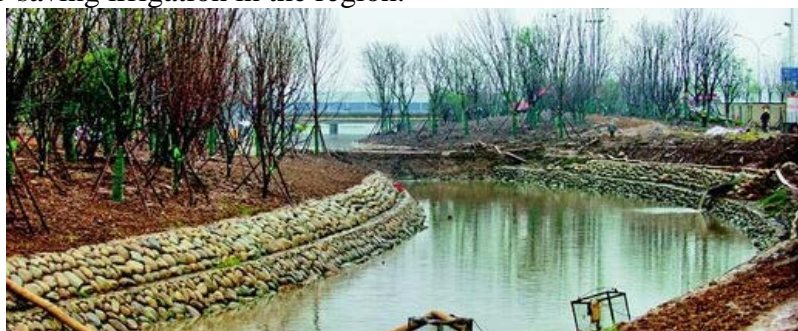
Figure 2 Rural water-saving irrigation channels

In the agricultural production areas of various regions, agricultural technicians will build a ditch (figure 2) for water diversion and irrigation, combining the local human, material and financial resources. However, due to the disrepair and long use time, there have gradually been silting and leakage of channels, which will affect the irrigation effect, which is not conducive to improving the efficiency of water-saving irrigation in the region.