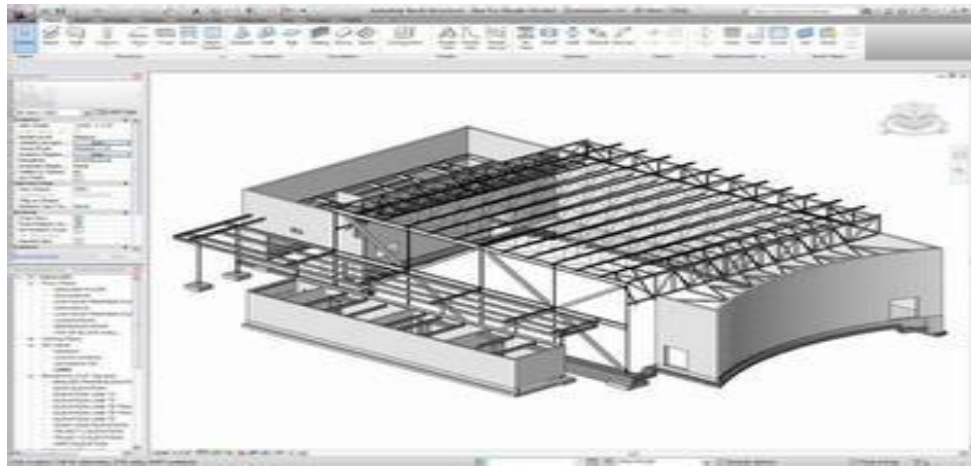
Figure 3 Architectural design presentation