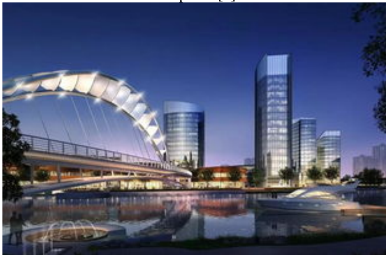
Figure 1 Construction

The influencing factors of building energy consumption are: building direction, building area, building structure performance and natural ventilation, coefficient of building body and so on. For BIM technology, the building energy saving test relies on the information model obtained by the architect to determine the direction of the building, the appropriate component size, material classification, functional division and other relevant information, and to use the analysis to meet the standard energy saving specifications. As far as possible to make the annual energy consumption to meet the requirements of the specified line specifications, if the energy-saving specifications, the content of the building model changes summary complete feedback to the architect, then the architect will need to give feedback on the proposed model changes. This cycle is repeated until the building meets the standards for energy conservation. Based on BIM technology, building energy saving not only solves the problem of architectural design, but also can perfect the conversion of data information in the design process, and the working level is improved. Therefore, it provides the basis for the optimization and upgrading of solar buildings and the research and analysis of air conditioning system, and then promotes the planning of building energy saving to become more scientific and meet the needs of realistic development[1].