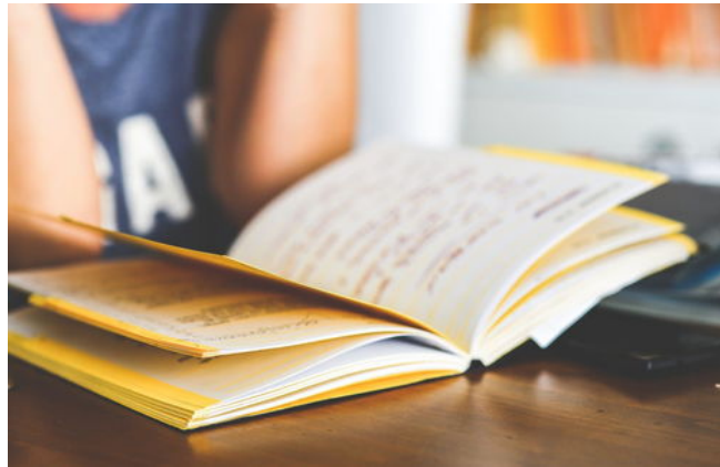
Figure 1 Technical English