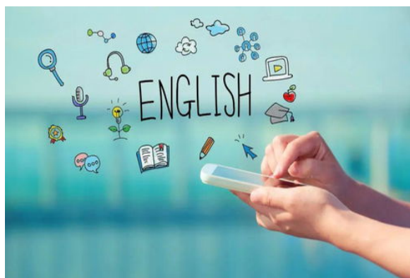
Figure 3 Technical English